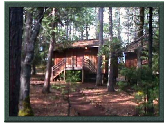
A shot of one of the cabins